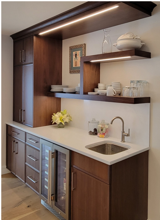
DECORATIVE MOOD LIGHTING