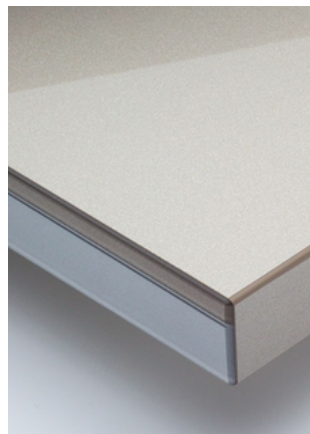
REFLEKT - METALLIC ACRYLIC

Need assistance on deciding if this product is right for your project?