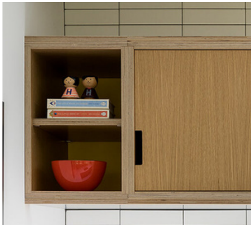
CUT OUT HANDLES